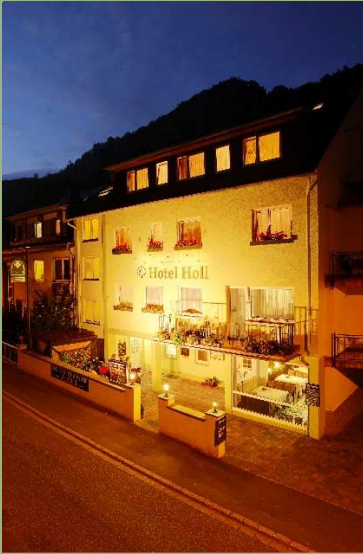
Hotel Holl bei Nacht

Escape from the everyday life for a few days.