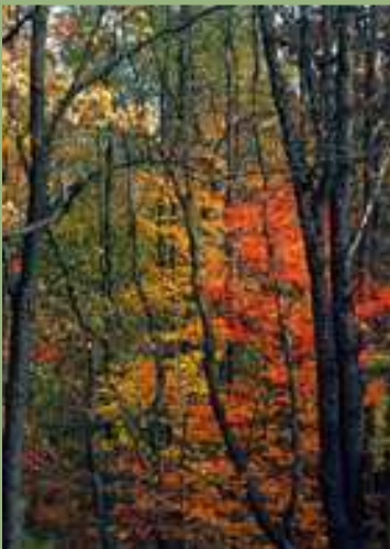
Hauseigener Berggarten gegenüber vom Hotel Holl